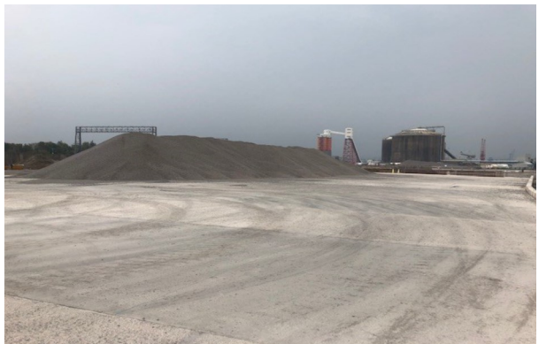
Storage and Handling Area

There are also significant Health & Safety hazards associated with mesh handling, cutting & fixing. ADFIL Design Engineers were required to provide a solution using DURUS high performance macro synthetic fibres to replace upper layers of steel mesh fabric and provide a highly durable reinforced concrete pavement.