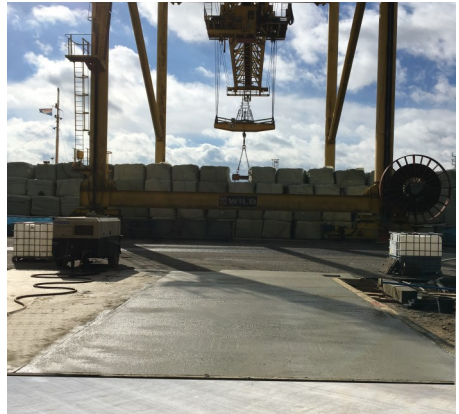
Boston Loading Crane

The busy cargo handling areas at the Port of Boston utilized DURUS Macro synthetic fibres to replace conventional steel mesh reinforcement. Large reels of steel cable were stockpiled ready for distribution, exerting heavy loads on the reinforced concrete pavement, along with high dynamic loads posed by mechanical handling equipment. The macro fibre reinforced concrete allowed minimal disruption to Port operations due to the fact steel mesh storage, handling and fixing was not required during installation.