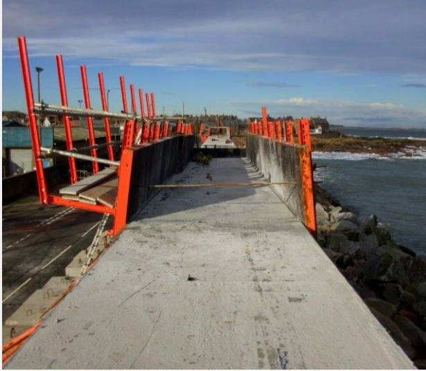
Shutter during construction. The road to the left the sea to the right