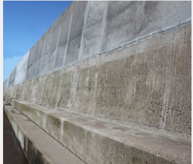
Sea Wall Enlargement