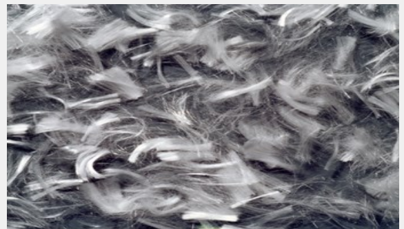
Fibrin XT BS EN 14889 Class 1a Micro Monofilament Fibre at 0.910 Kg per Cubic metre of concrete